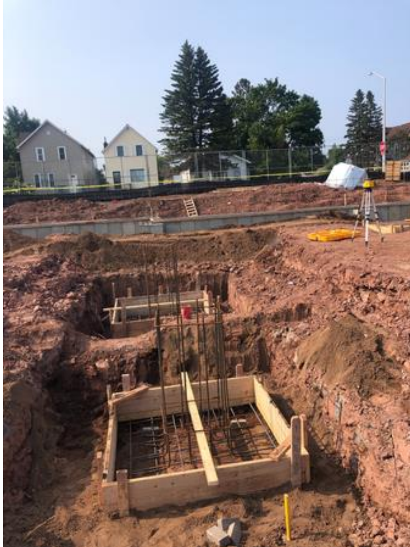
Footings and foundations ongoing at Cafetorium Addition