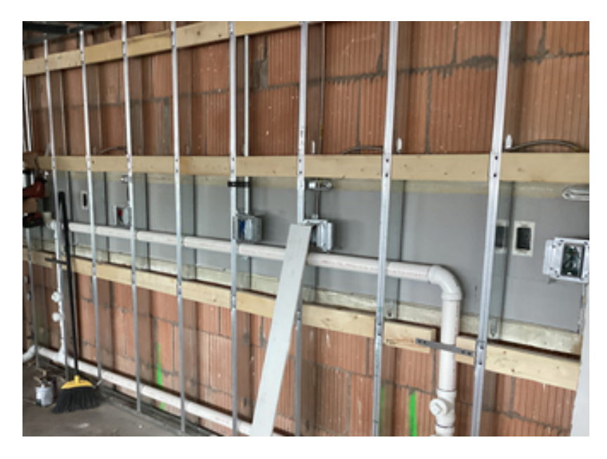
Science Classrooms plumbing and electrical rough ins.