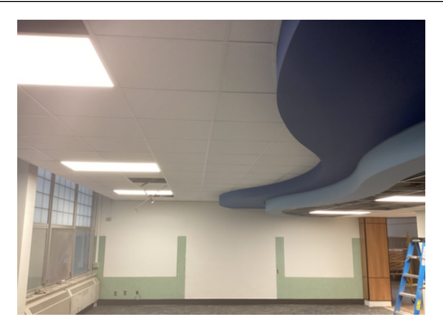
Flex Space-Carpet, Ceiling, and Light Fixtures Installed

Address: 137 Banks Blvd. Silver Bay, Minnesota 55614