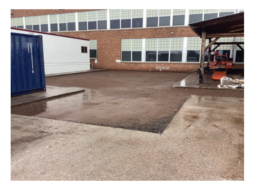
Base work for new asphalt outside of cafeteria

Address: 137 Banks Blvd. Silver Bay, Minnesota 55614