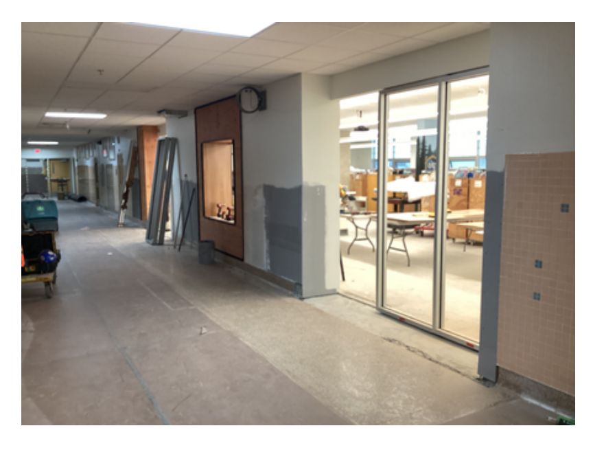
Media Center Corridor Interior Glass Installation

Address: 137 Banks Blvd. Silver Bay, Minnesota 55614