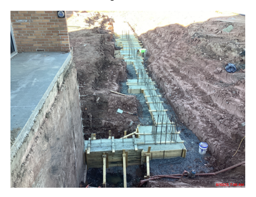
Footings and foundations at Music Suite addition