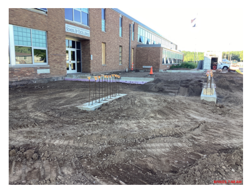
Backfilled soil for main entrance addition