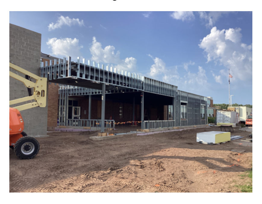
Exterior wall framing at new main entrance