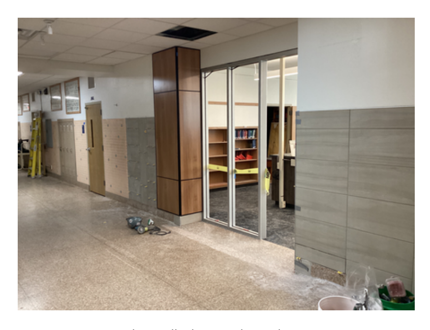
Corridor Wall Tile Outside Media Center