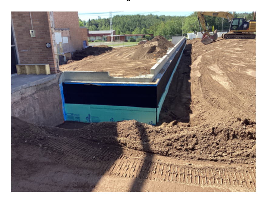
Music Addition Water Proofing and Insulation