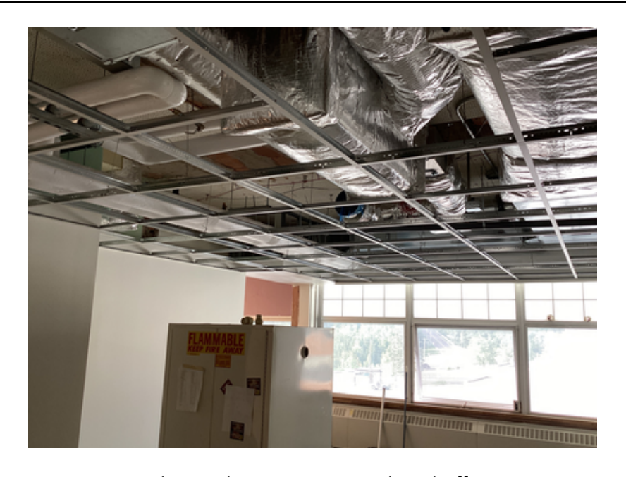
Ceiling Grid in Science Room Shared Office

Address: 137 Banks Blvd. Silver Bay, Minnesota 55614