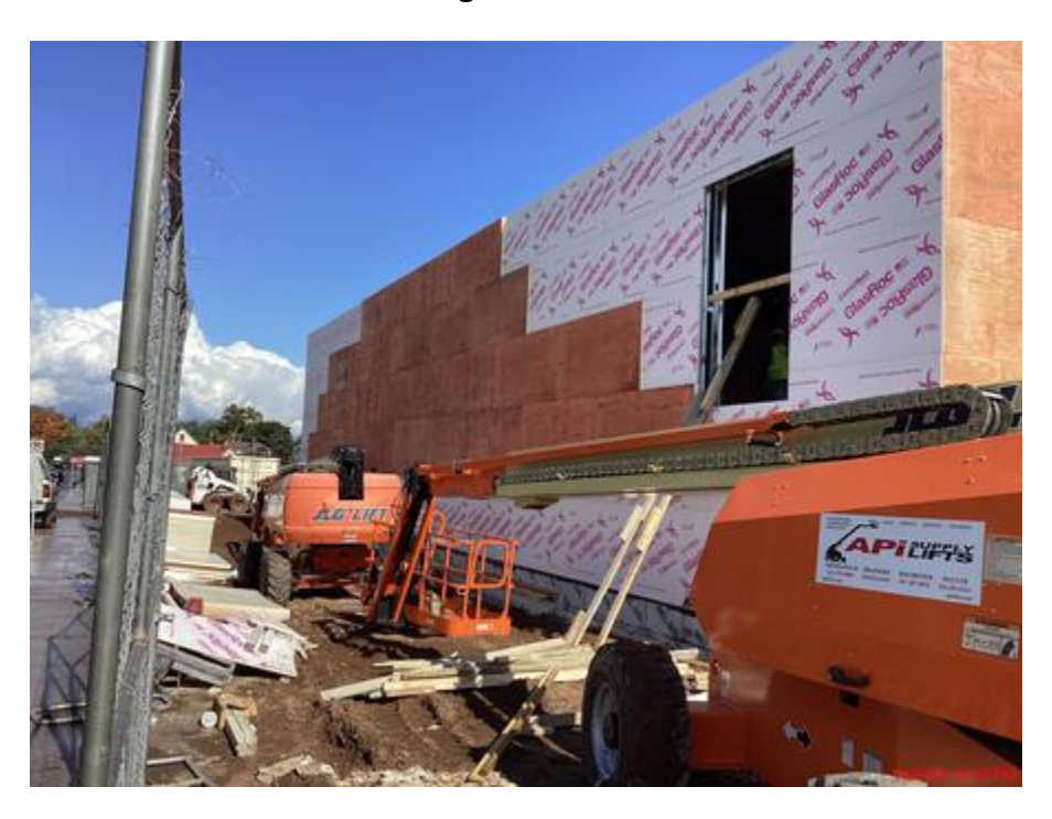
Exterior sheathing and plywood installation ongoing