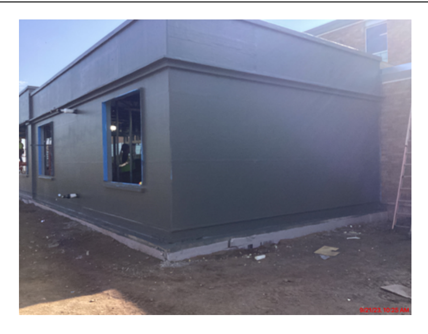
Weather proofing on main entrance addition

Address: 137 Banks Blvd. Silver Bay, Minnesota 55614