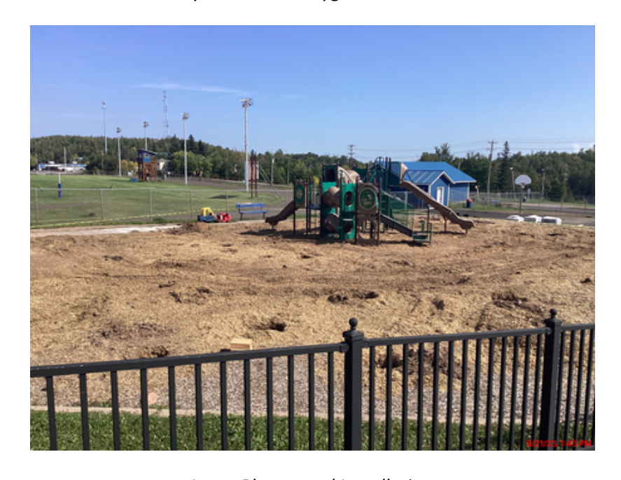
Large Playground Installation