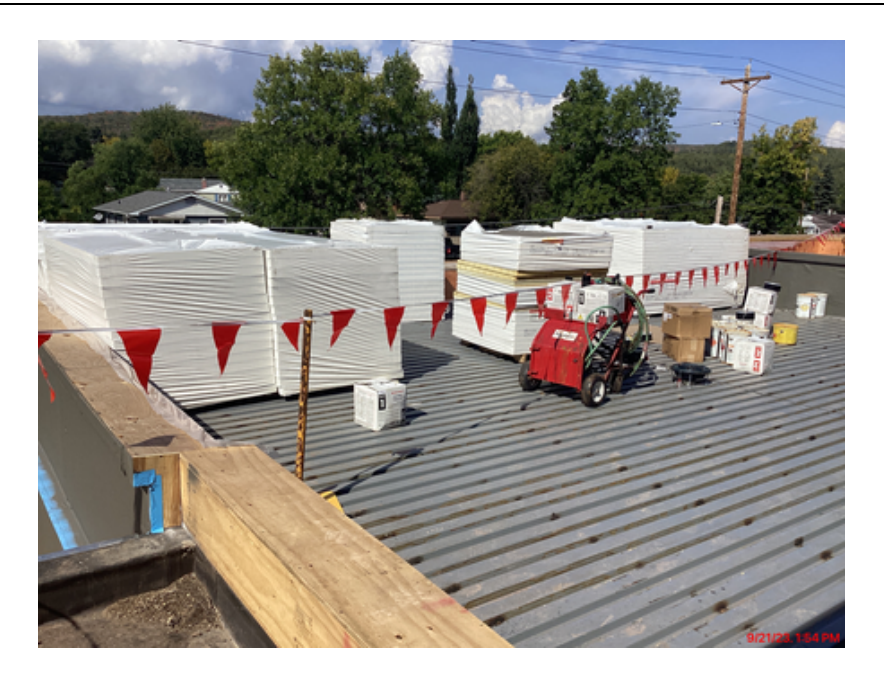
Roof work and staging at main entrance addition.

Address: 137 Banks Blvd. Silver Bay, Minnesota 55614