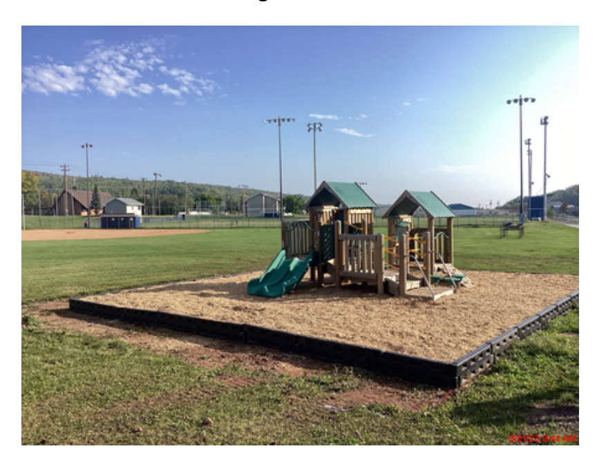
Early Childhood Playground Installed