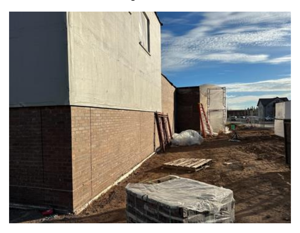
Brick installation ongoing