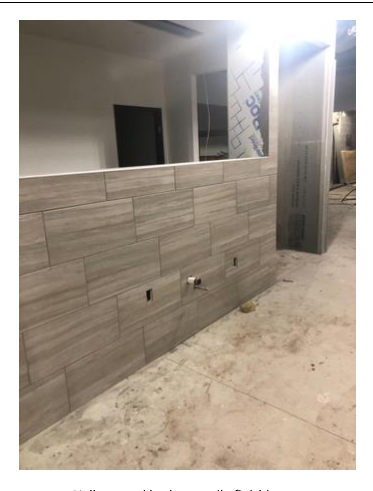
Hallway and bathroom tile finishing up

Address: 421 7<sup>th</sup> Street Two Harbors, MN 55616