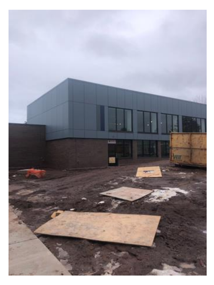
Exterior Metal Panels finishing up