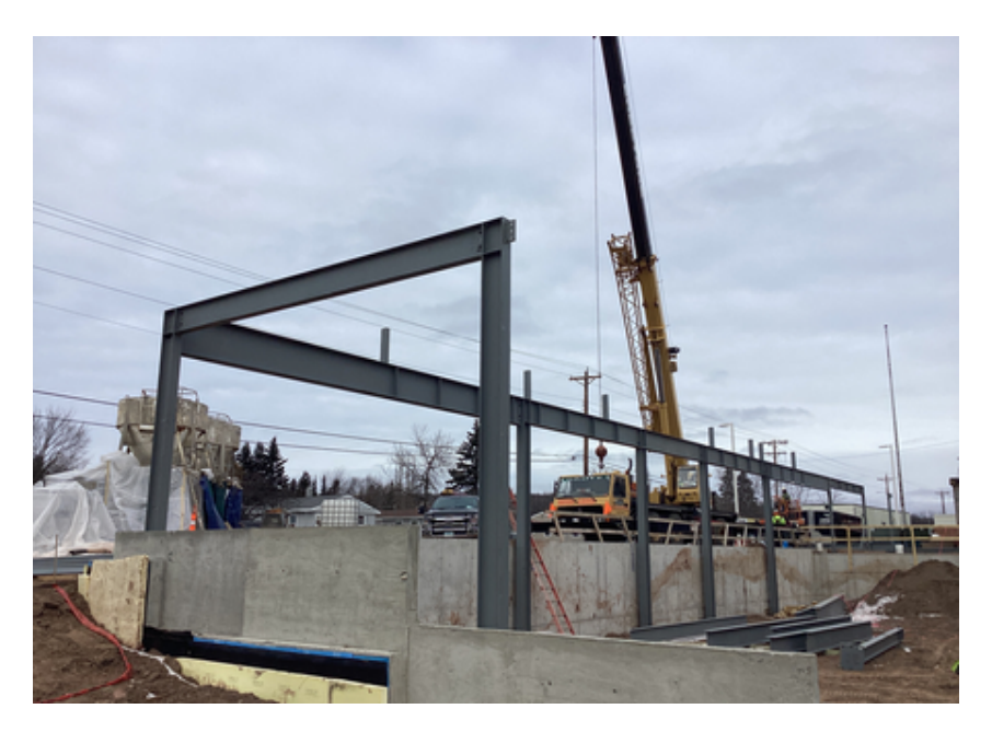
Structural steel installation Area B Music Suite