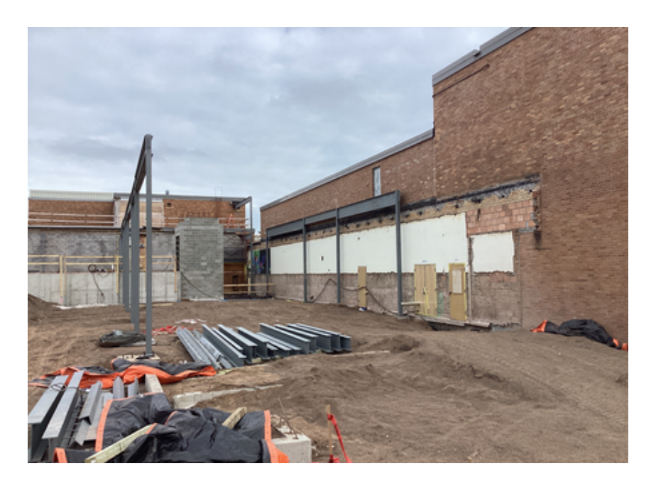
Structural steel installation Area B Music Suite